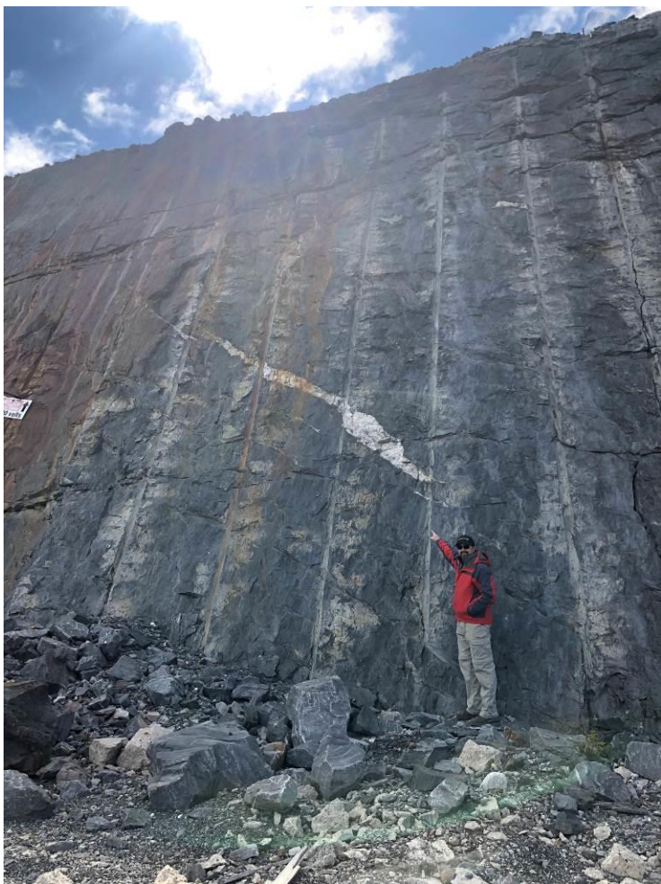
Figure 3: Example of the pinch and swell nature of quartz veining at Troilus in the Z87 pit wall