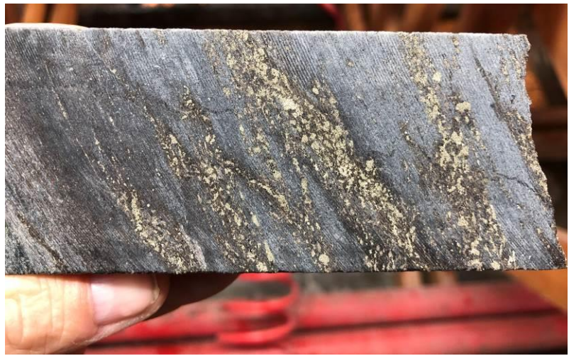
Figure 4: Sulphide-rich Zone, Z87 South