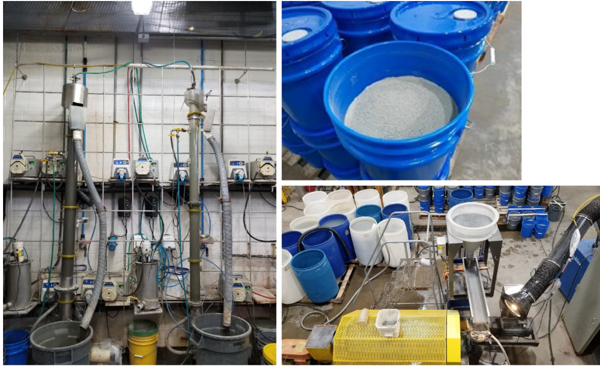
Figure 1. J Zone Homogenized Ore Sample (top); Rougher-Scavenger Column Flotation (Left); Bulk Milling Circuit (right)